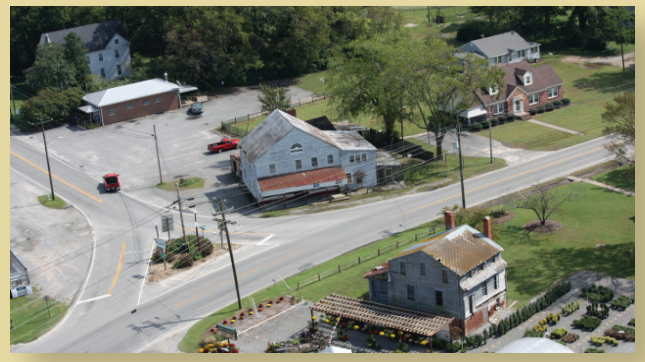
Above: Aerial view of Chuckatuck crossroads. (Drexel Bradshaw)

We are upgrading our website, ChuckatuckHistory.com , in format and capability to give users more information about the community and its surrounding history. It continues to be a workin-progress as resources are available.